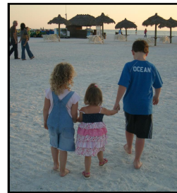
"Suffering" into the sunset!!