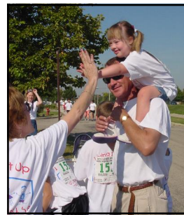
The high fives at the finish line are priceless!

On June 11 th GiGi's Playhouse is having it's 3 rd Annual Down Syndrome Awareness 5 k Fun Run / 1 mile Walk at Busse Woods at 9 A.M.. This is a great opportunity for you and your children to "make a difference by not seeing a difference". Our goal is to invite the community in so they can see how beautiful Down syndrome can be. I promise you will not get better high fives at the finish line than at this event!